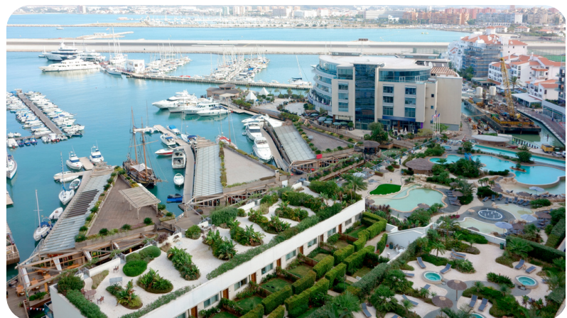
Development in Gibraltar

...the ecosystem for crypto funds in the UAE is not yet developed to its full potential; the various regimes being still too restrictive to be effectively usable for many crypto strategies.