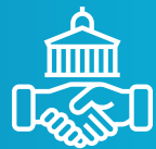
Public bodies & Government